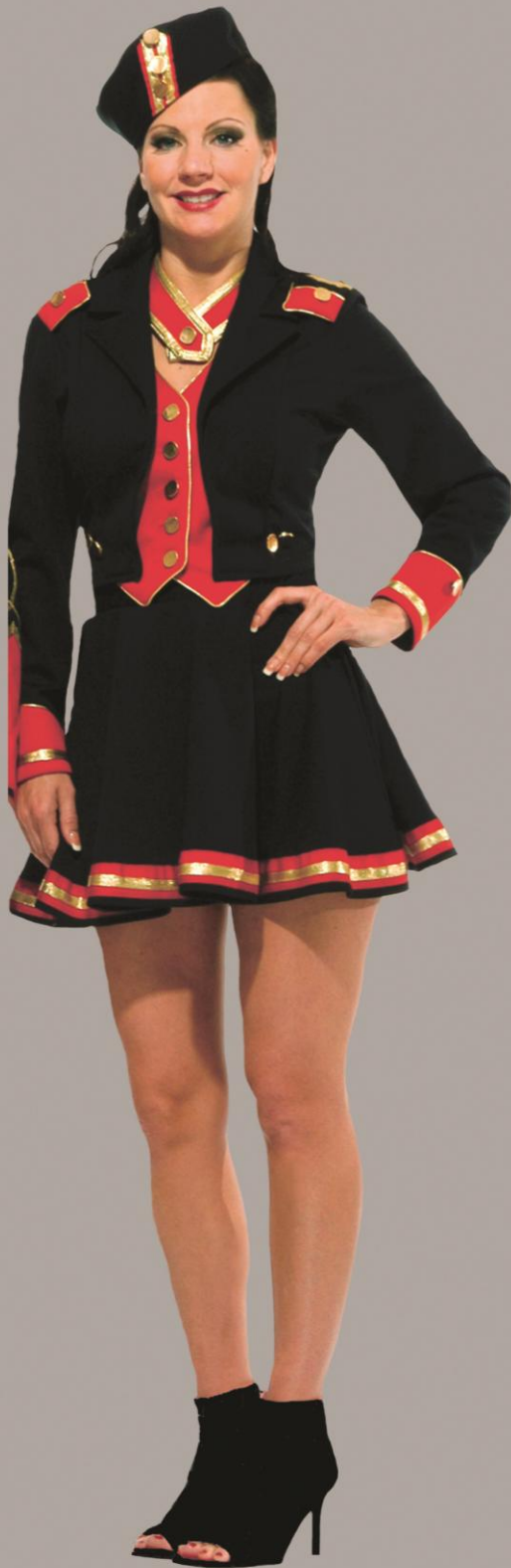
Cigarette Girl # 7804 S-M-L No Accessories