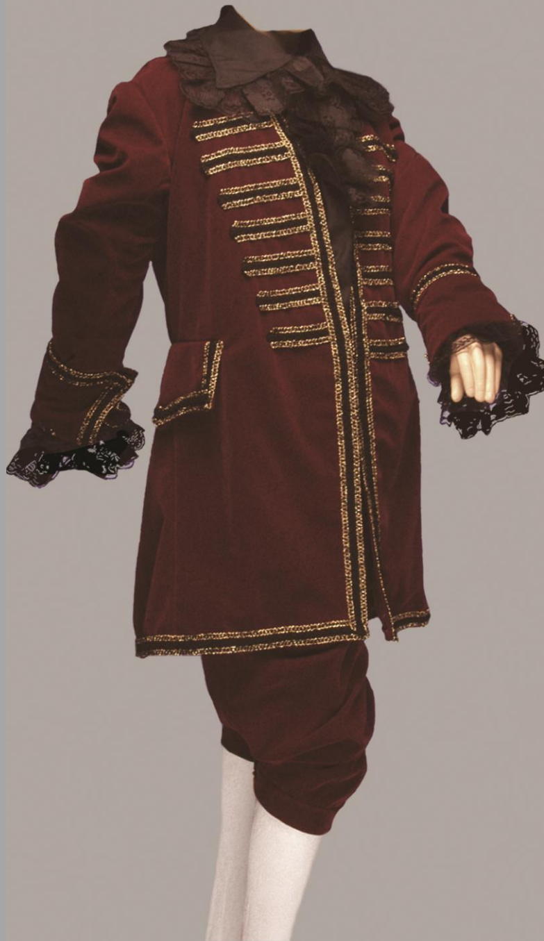
Amadeus Beethoven # 3017 S-M-L-XL No Accessories