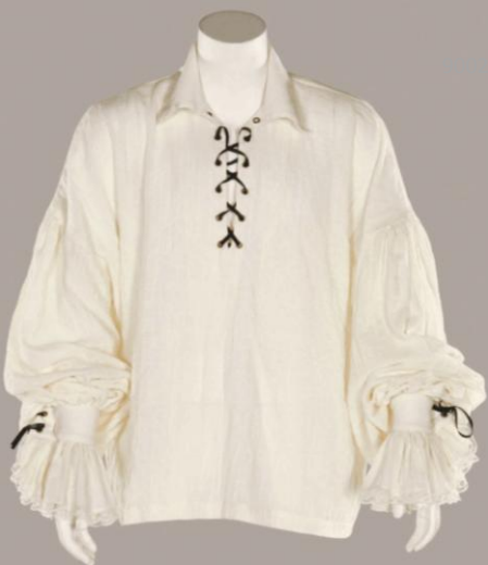
"Pirate Shirt" #9007 M-L-XL-2XL No Accessories