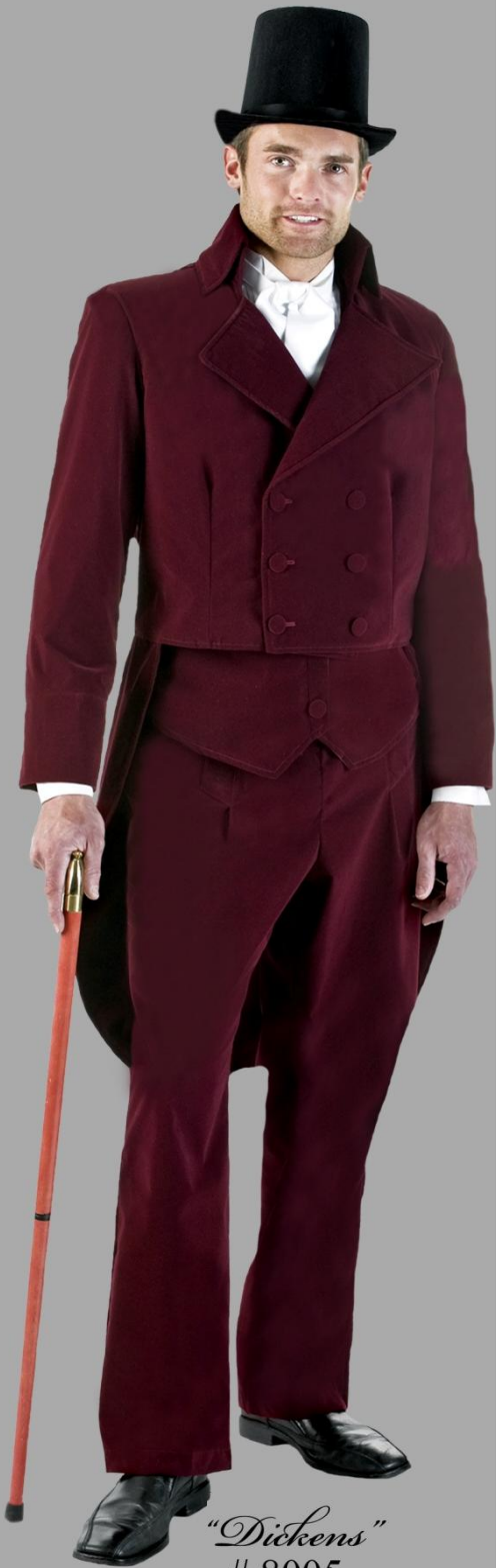
"Dickens" # 8005