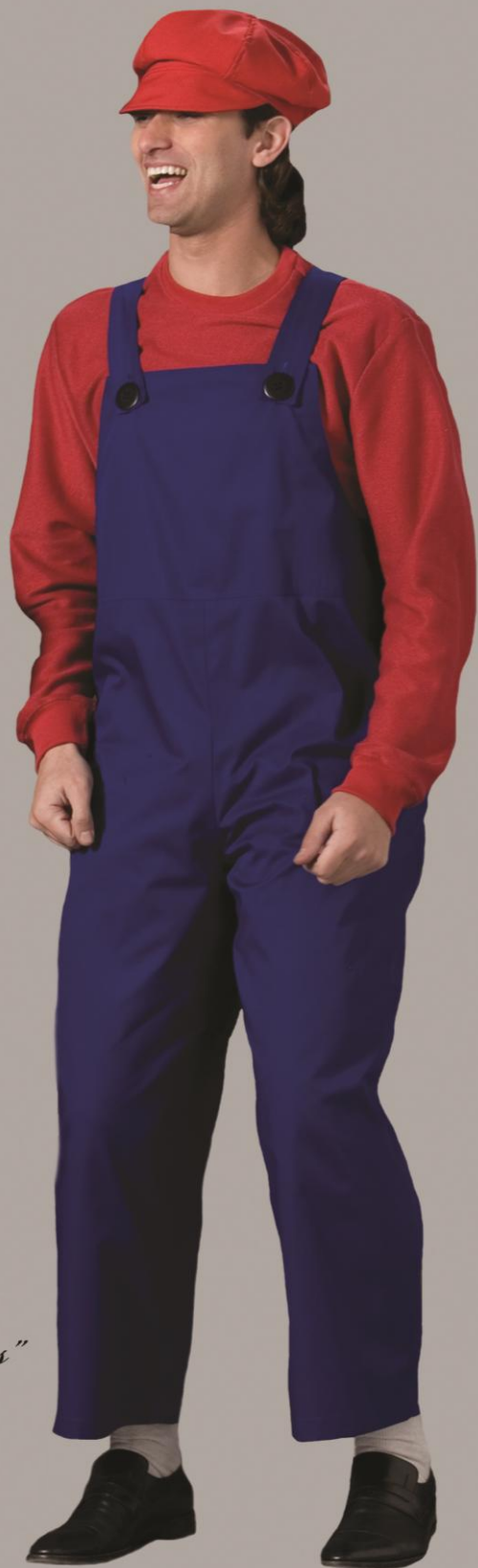
"Cartoon Boys" # 7962 M-L-XL-2XL