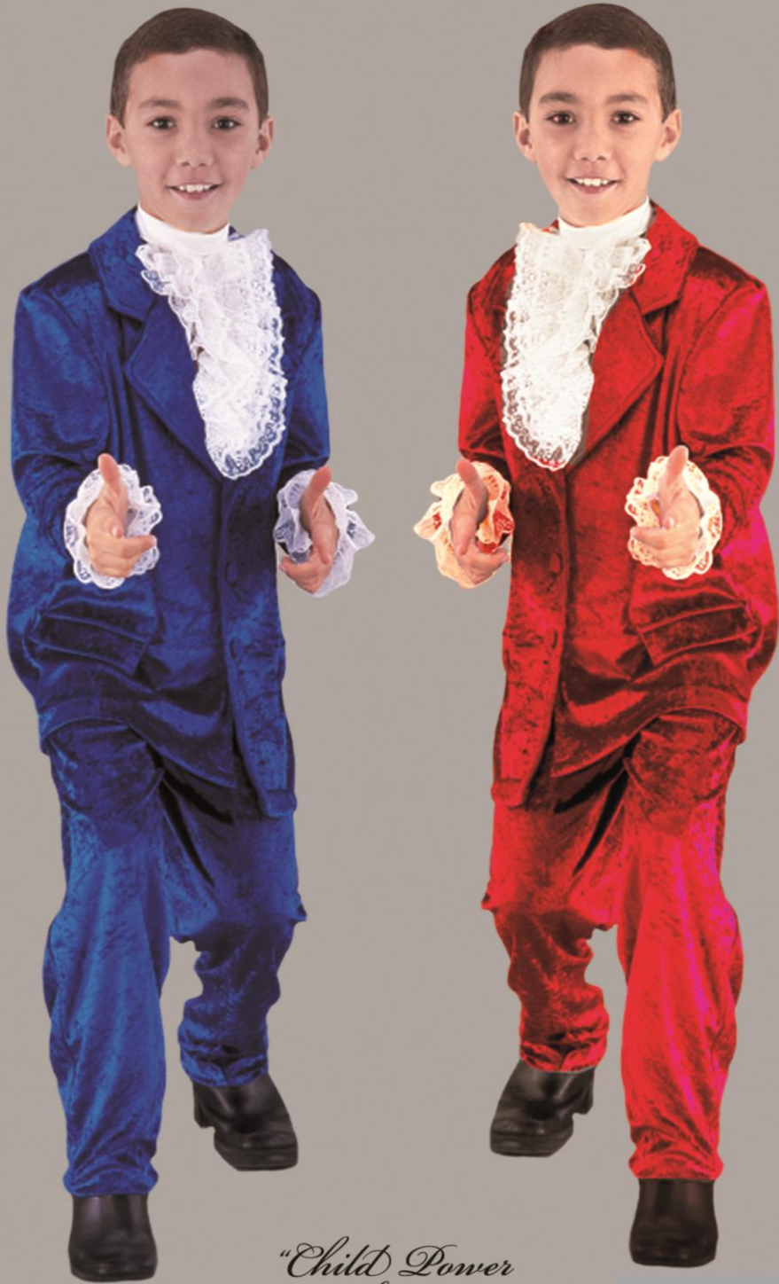
"Child Power Suit" # 3034 S-M-L No Accessories