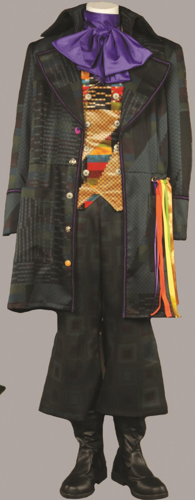
"Hatter" # 1009 Patchwork printed Gaberdine. M-L-XL-2XL