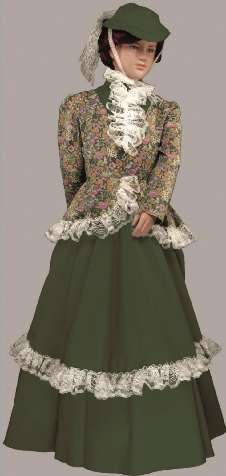
Prairie Dress # 3023 S-M-L-XL No Accessories