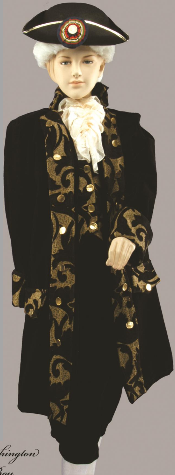
George Washington Colonial Boy # 3020 S-M-L-XL