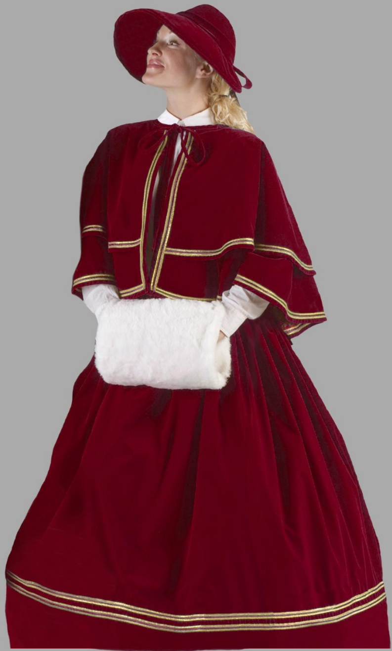
"Carolers" # 8006

Delightful four piece. Reversible cape, with plaid taffeta inside. Skirt with gold trim, faux fur muff, and velvet hat included. S-M-L and Plus size. (Maroon and Green)