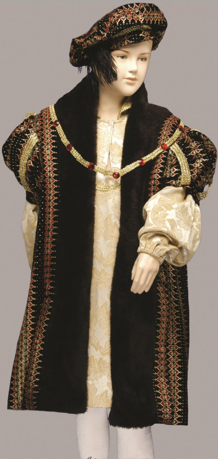
16th Century Prince