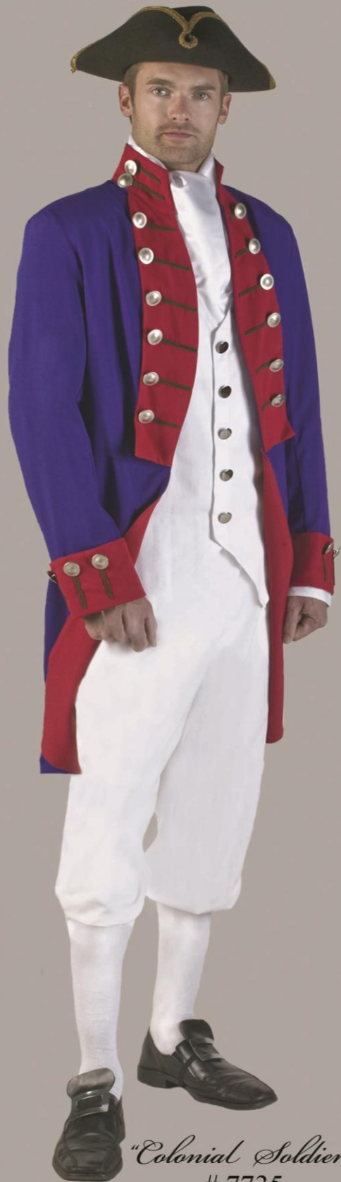
"Colonial Soldiers" # 7735 M-L-XL-2XL No Accessories