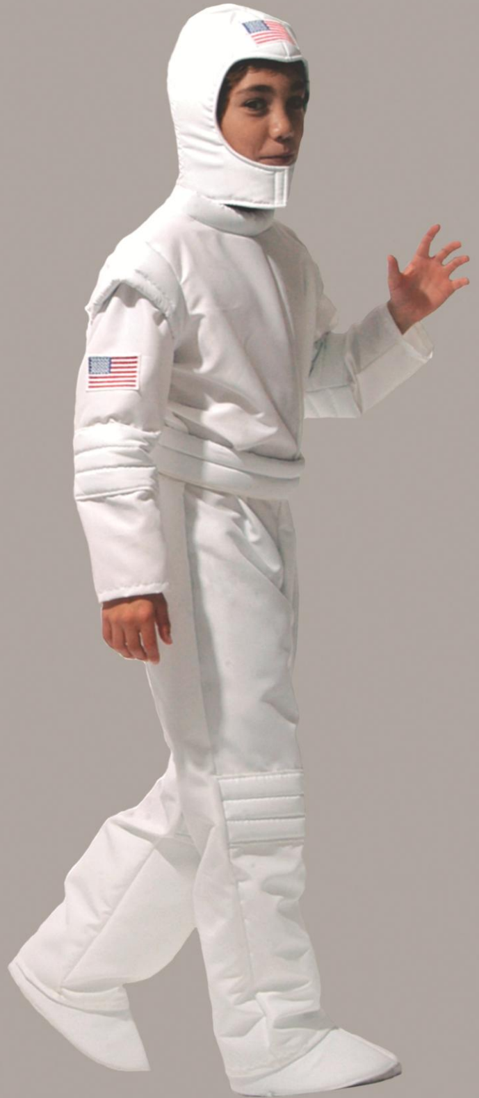
"Astronaut" (Child) # 3032 S-M-L-XL No Accessories