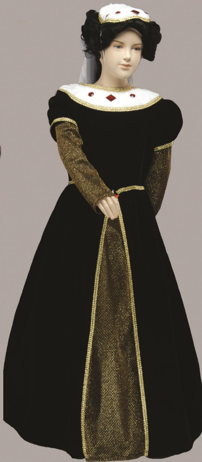
16th Century Princess