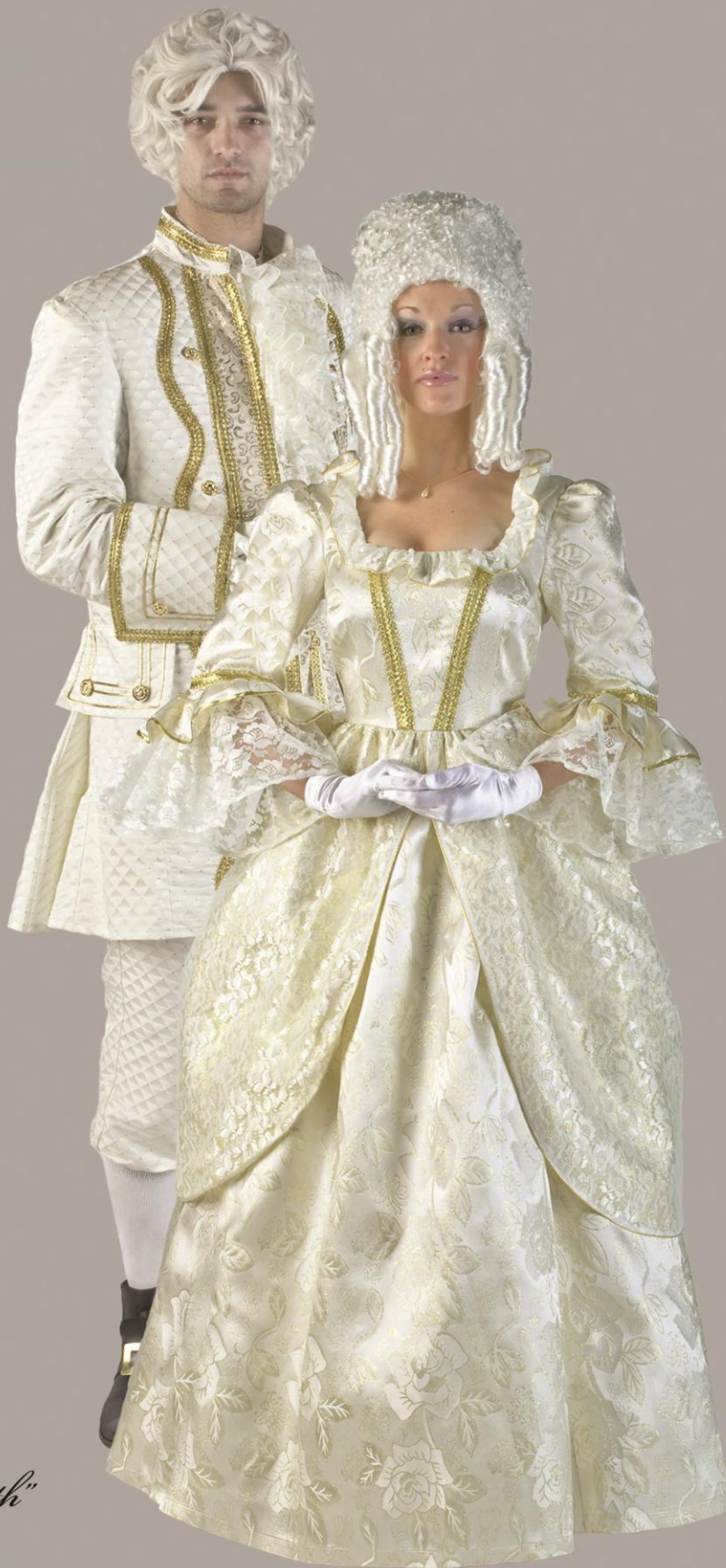
"Louis 16th" # 7710 M-L-XL-2XL