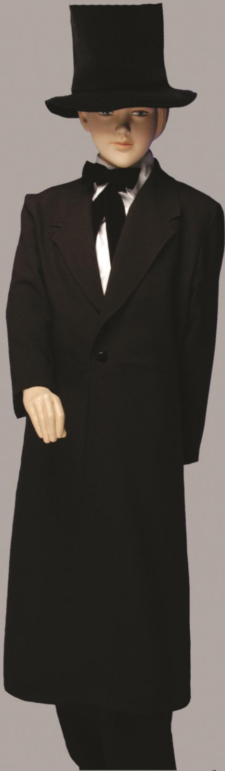
Abe Lincoln, Gambler, Gunlinger, Riverboat # 3024 S-M-L-XL No Accessories