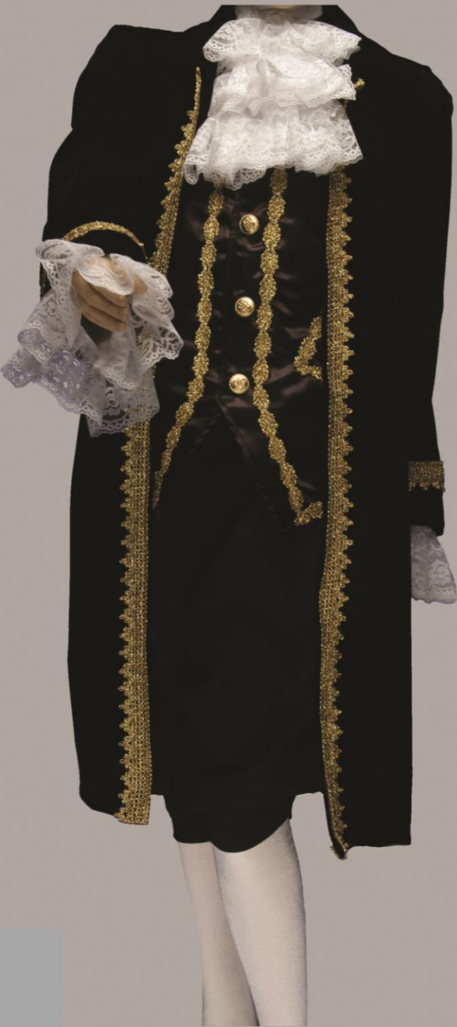
No Accessories Thomas Jefferson Beethoven, Mozart # 3021 S-M-L-XL