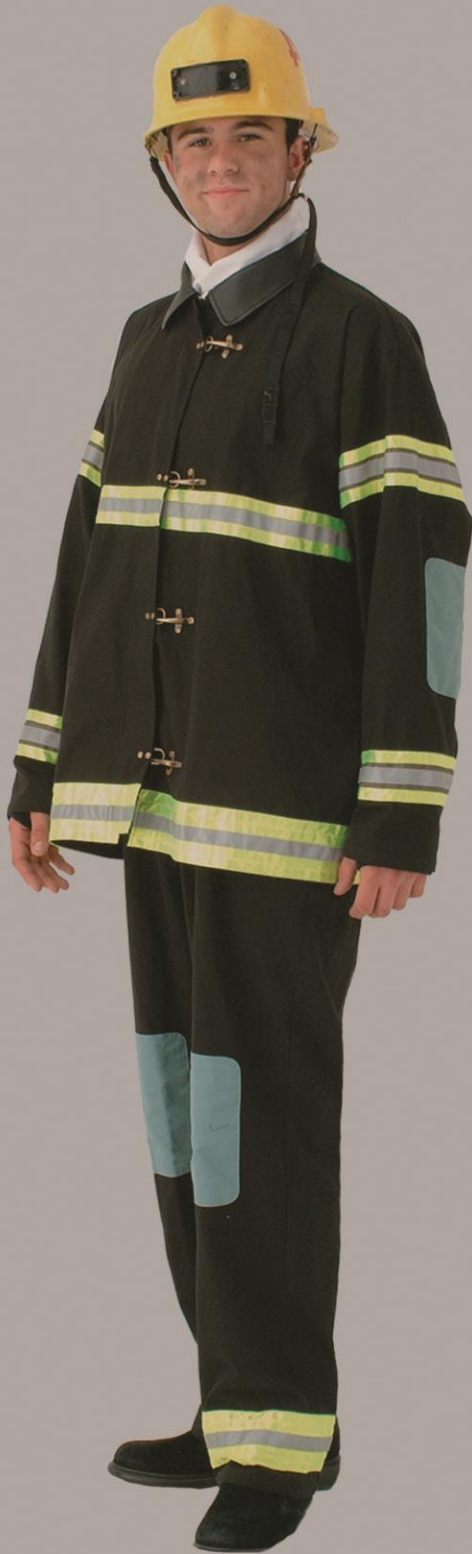
"Fireman" # 7810 M-L-XL-2XL No Accessories