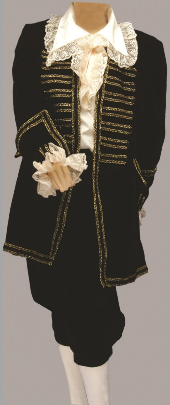
Amadeus Pirate # 3016 S-M-L-XL No Accessories