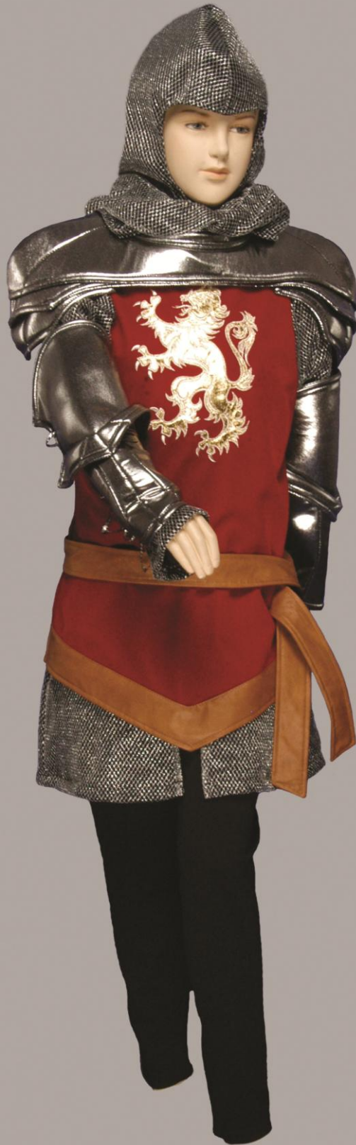
Warrior Prince # 3012 S-M-L-XL No Accessories