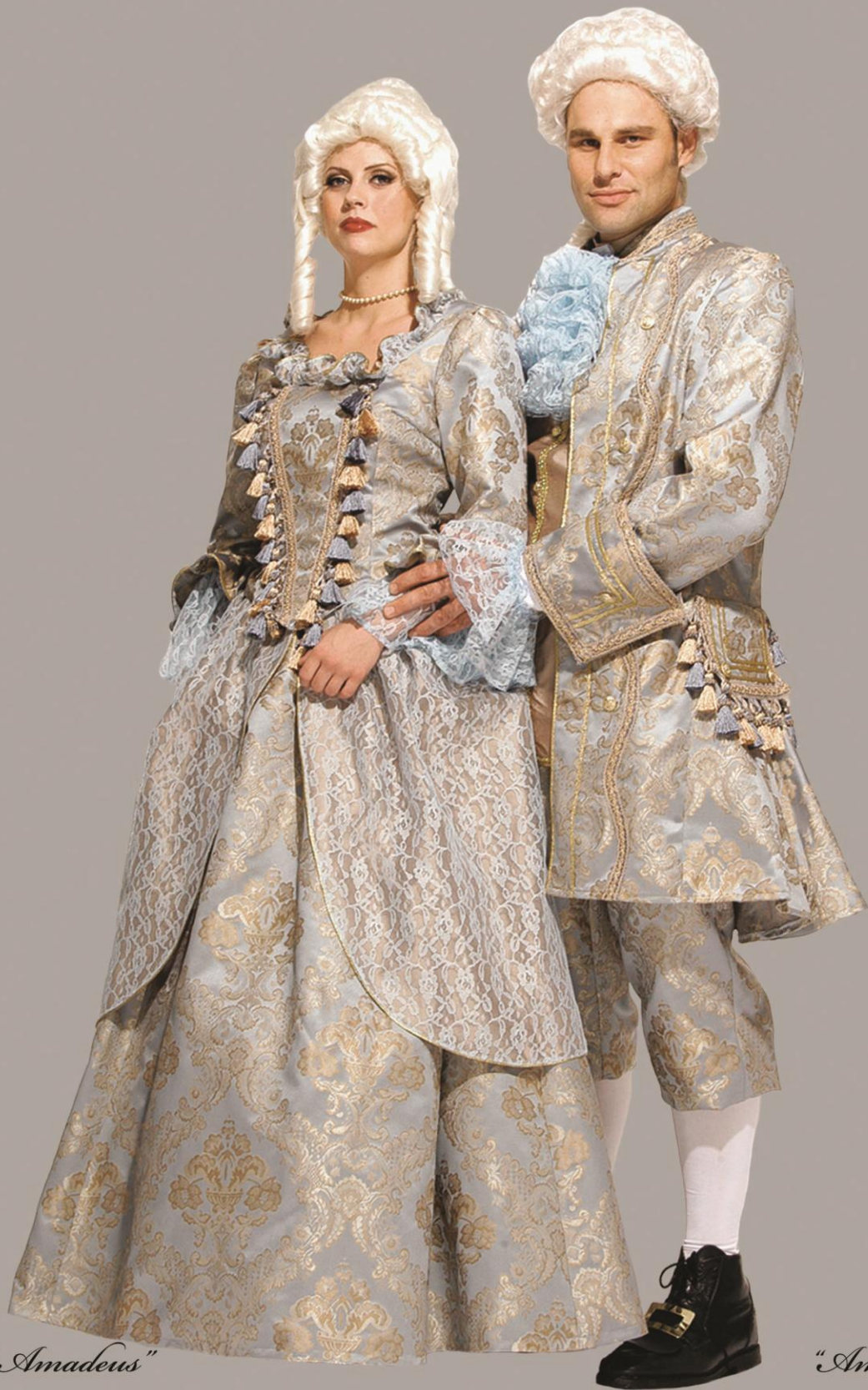
"Lady Amadeus" # 7703 S-M-L