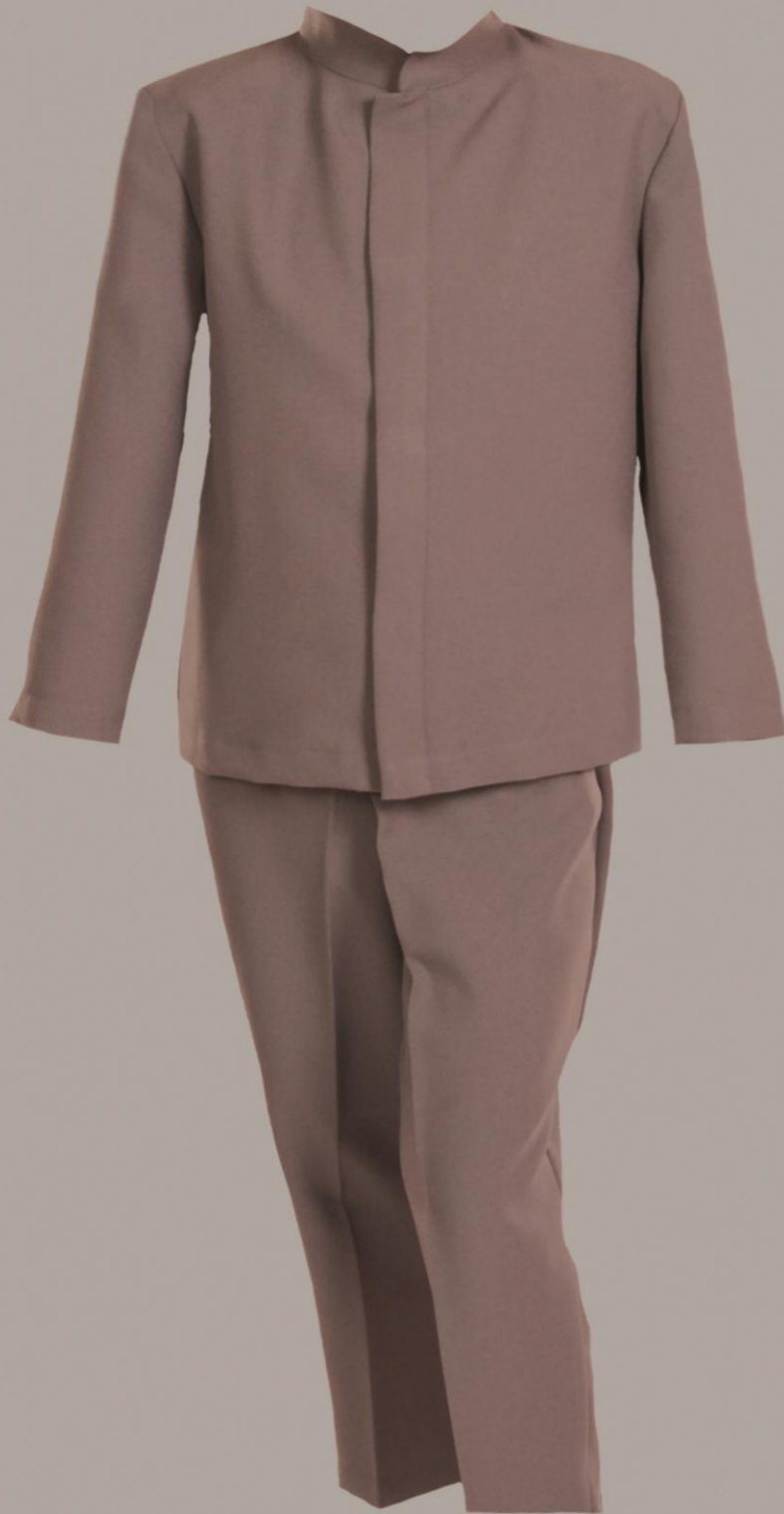
"Evil Child" # 3037 S-M-L No Accessories