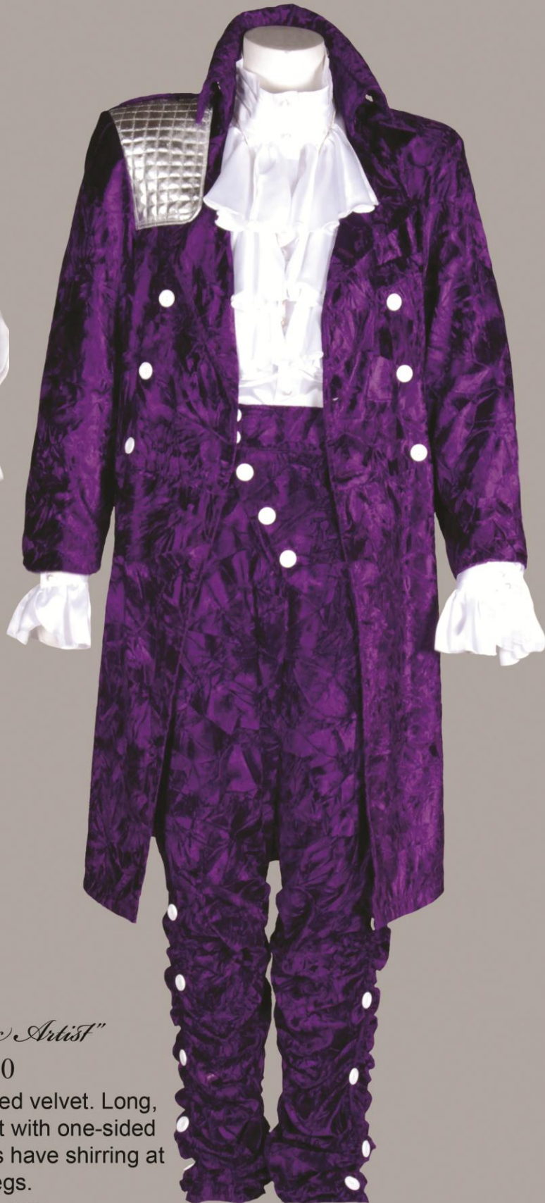
"80s Music Artist"