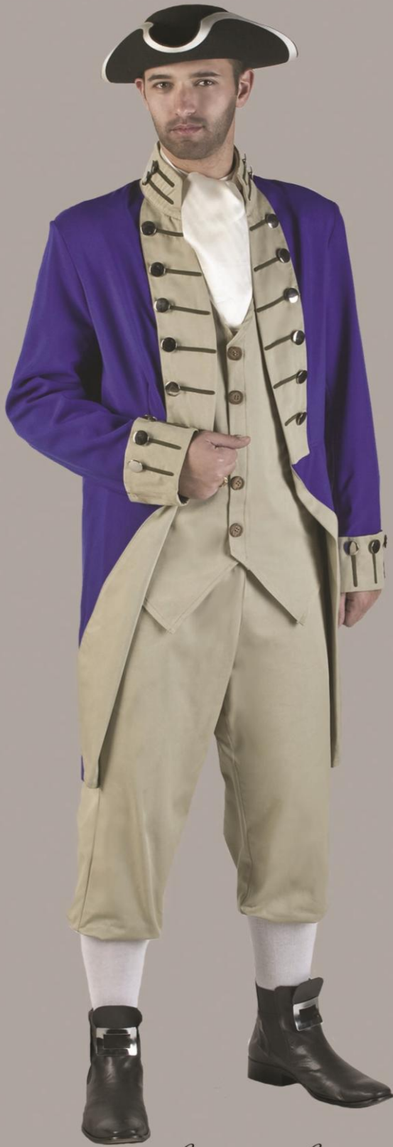
"Colonial Soldiers" # 7734 M-L-XL-2XL No Accessories