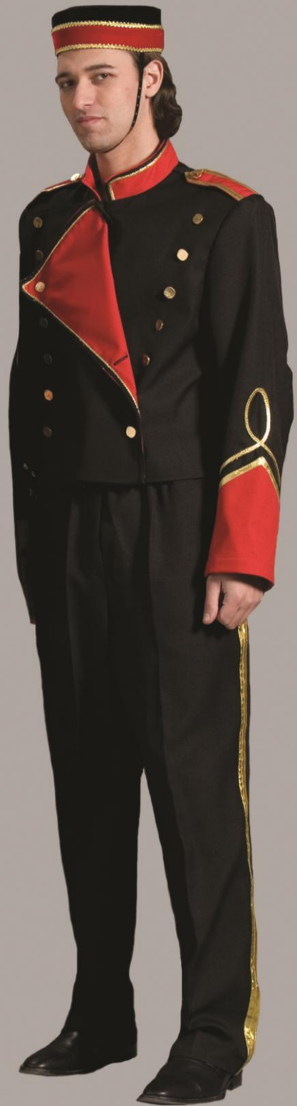
Bell Boy # 7803 M-L-XL-2XL No Accessories