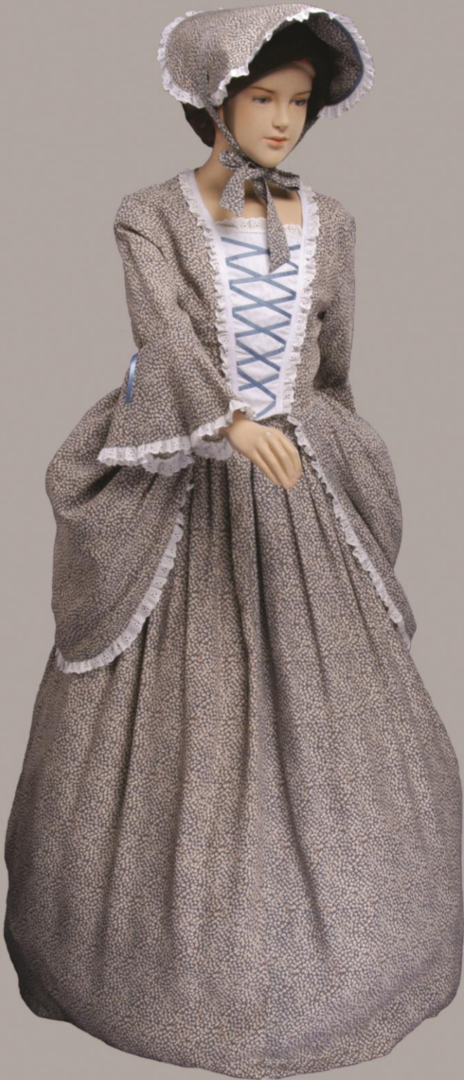
Colonial Girl # 3022 S-M-L-XL No Accessories