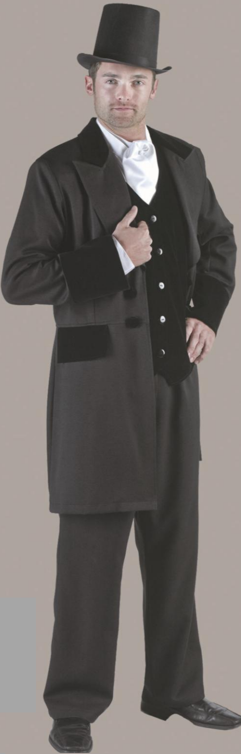
Prince, Rhett Butler # 8015

Gabardine frock coat with velvet collar & cuffs.