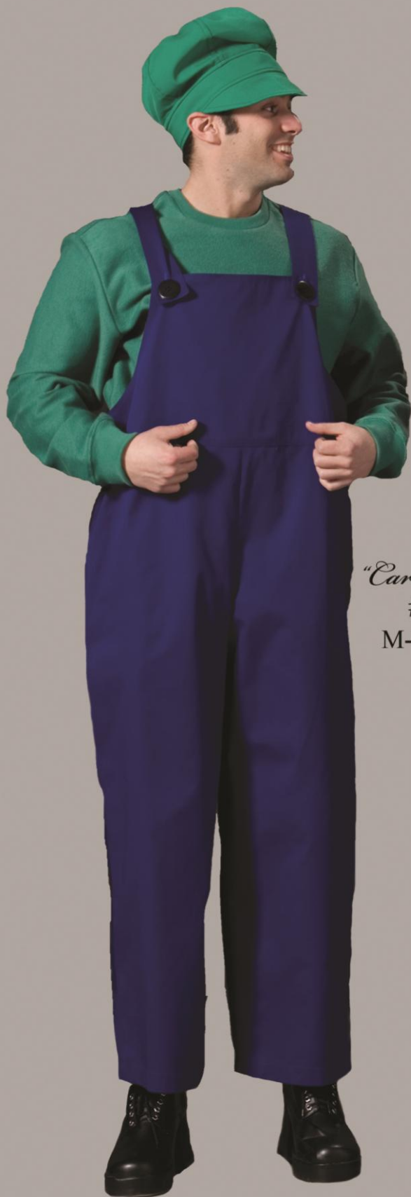
"Cartoon Boys" # 7961 M-L-XL-2XL